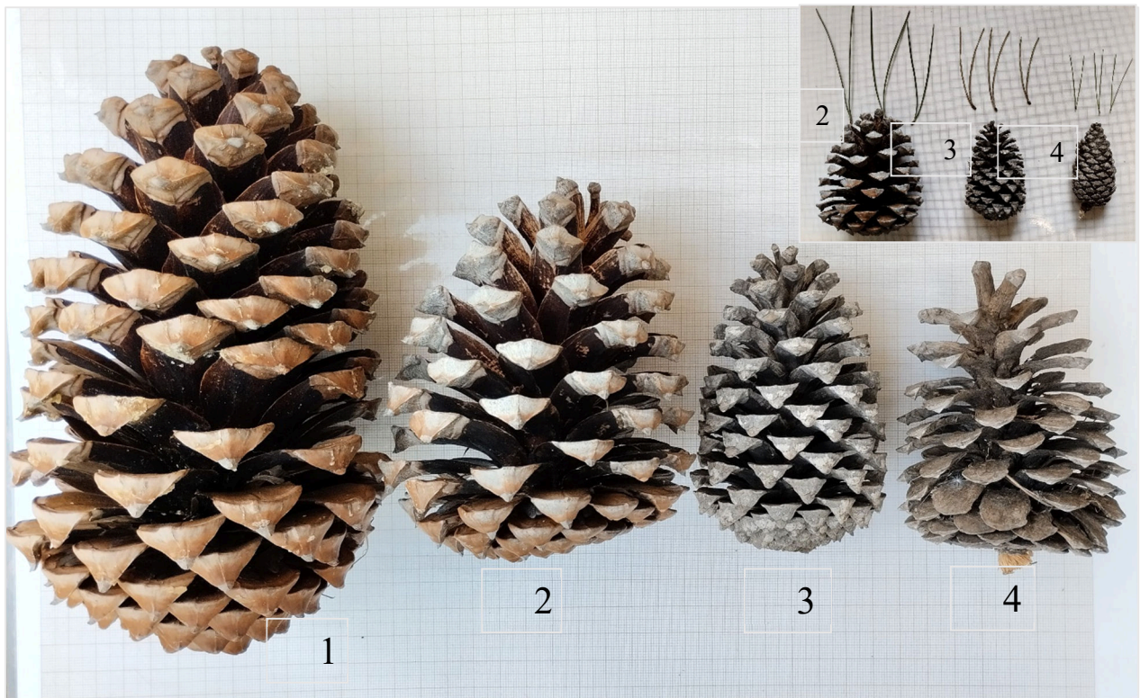
Figure 1. Female cones and leaves of Pinus pinaster subsp. escarena (1 & 2), P. × saportae nothosubsp. currasii (3, from the holotype specimen at VAL 252111), and P. halepensis (4).

(Recibido el 6-VII-2023) (Aceptado el 30-IX-2023)